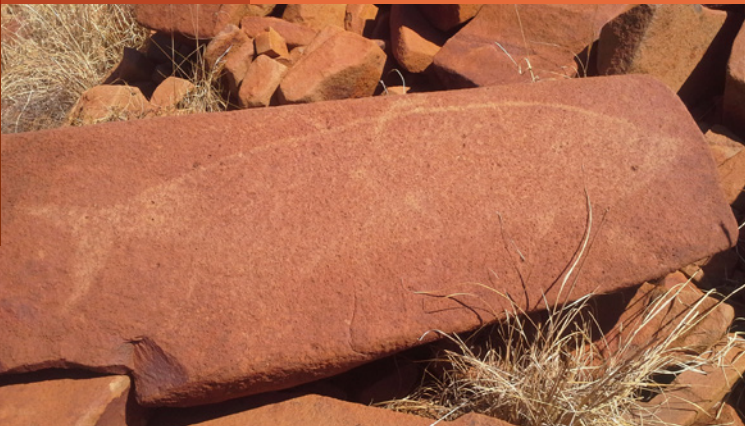
Photo: Turtle with eggs engraving