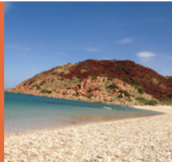
Photo: Hearson's Cove

The Murujuga Research Protocols have been developed by the Murujuga Aboriginal Corporation as a set of governing principles and guidelines to ensure research is conducted in a respectful and culturally appropriate manner.