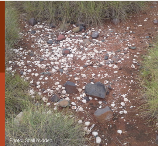
Photo: Shell midden