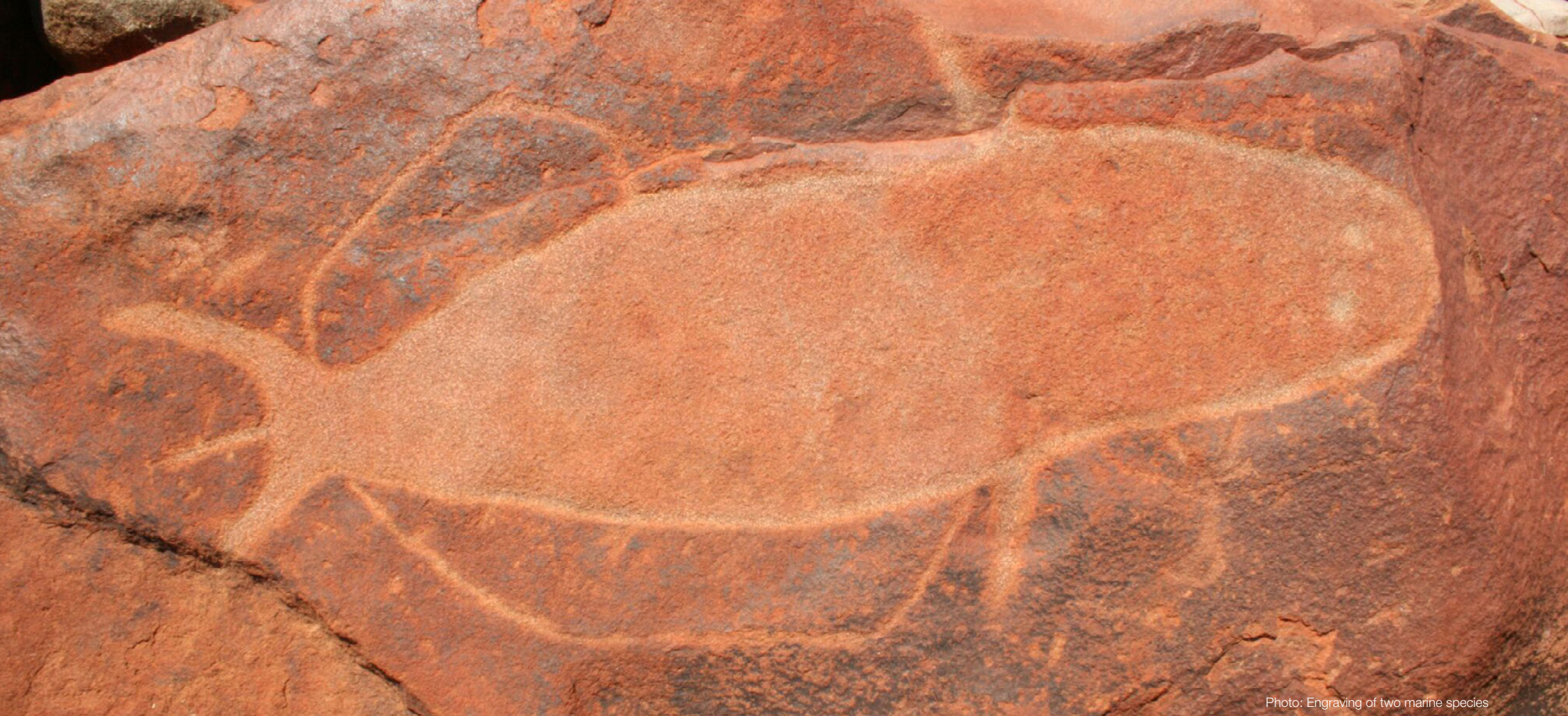
Photo: Engraving of two marine species