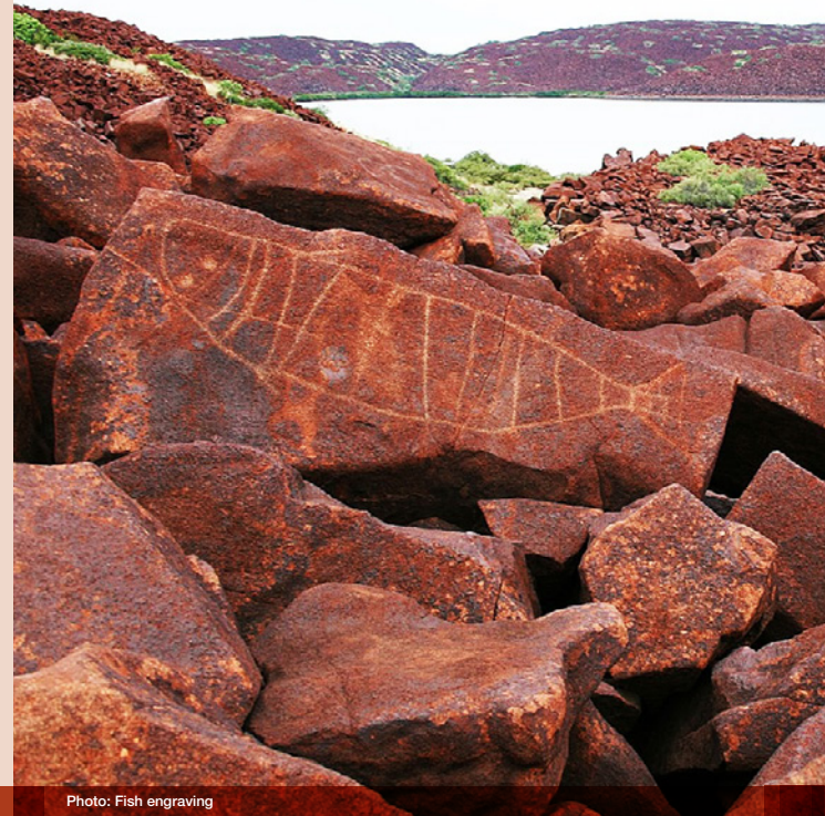
Photo: Fish engraving

Government of Western Australia Department of Water and Environmental Regulation