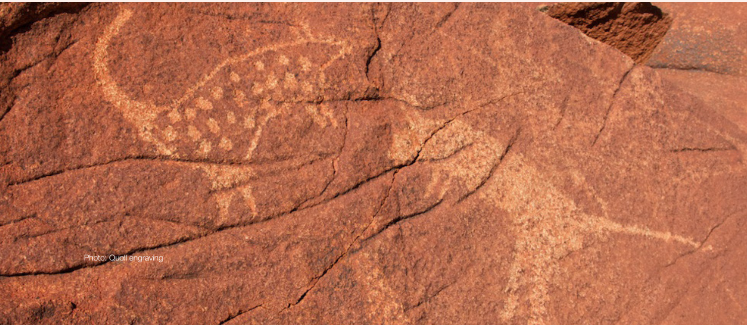
Photo: Quoll engraving