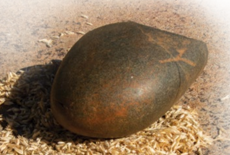
Above Ngajarli Trail. Left Spinifex seeds ground to make flour using grinding stones.

Interpretive panels along the trail tell of the life lead by Ngarda Ngarli who once camped at Ngajarli. Highlights include a shell midden, grinding stone, and medicine plants. For information on guided tours by MAC, visit Experiencemurujuga.com